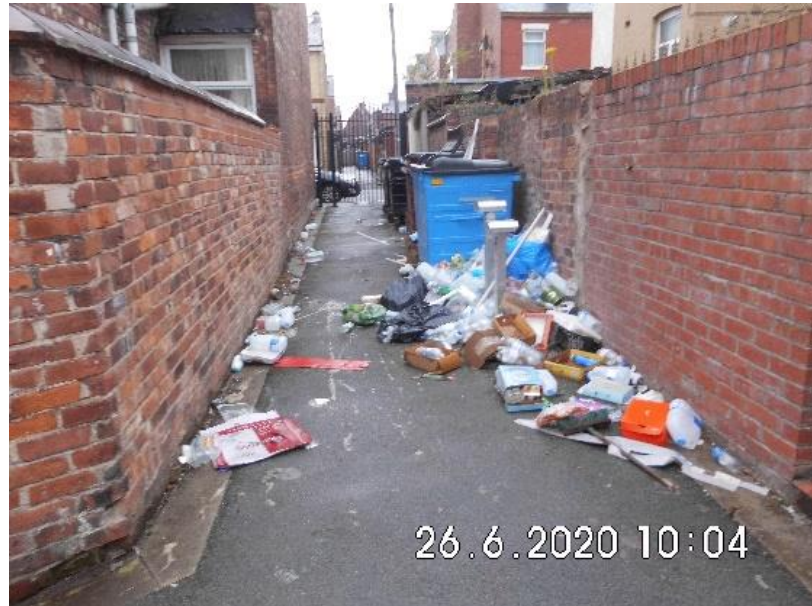
Egmont Street Before