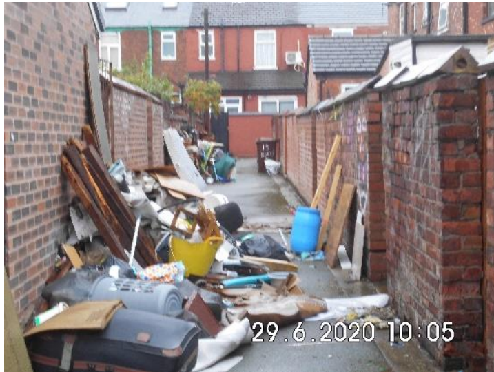
Hayley Street Before