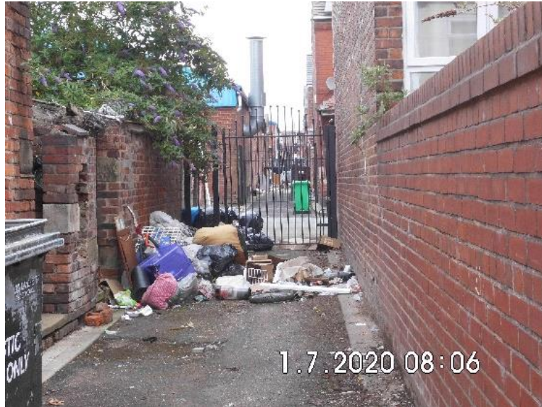
Galsworthy Avenue Before