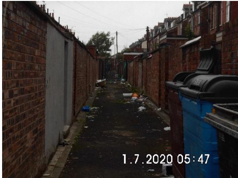
Cheetham Hill Road Before