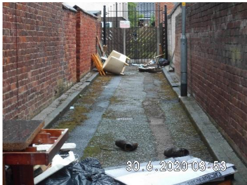
Brideoak Street Before