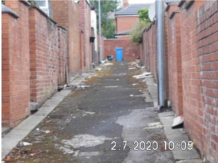
Clibran Street Before